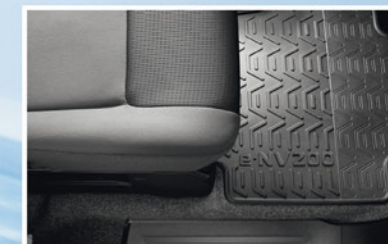
Rubber mat (09, 32)