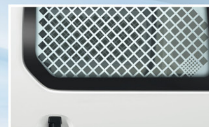
Sliding door protection grille (52)