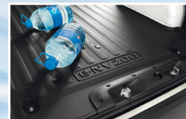
Plastic floor protection and trunk entry guard (47, 71)