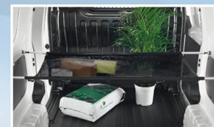
System bars for multi partition net (51)