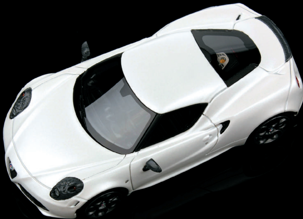
4C model car 1:43 scale model car